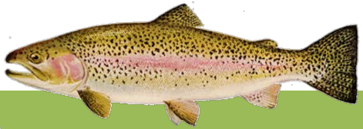
rainbow trout ( Oncorhynchus mykiss )